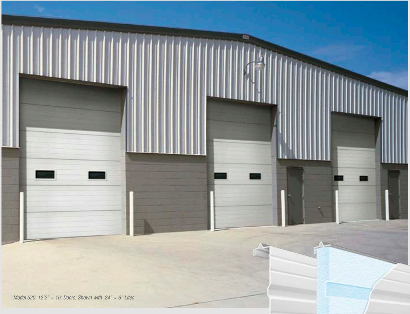
Model 520, 12'2" x 16' Doors; Shown with 24" x 6" Lites