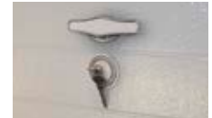
Outside keyed lock