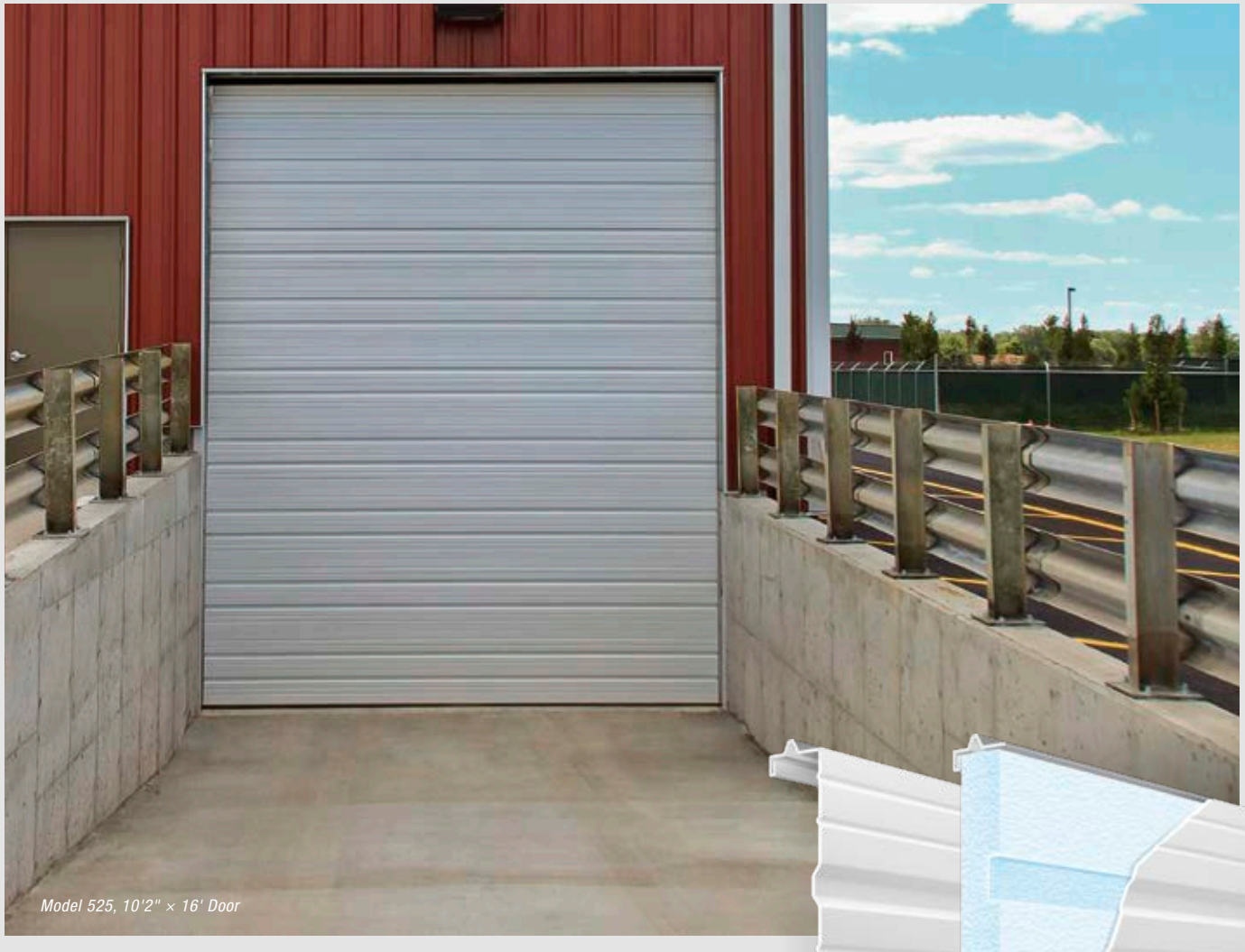
Model 525, 10'2" x 16' Door